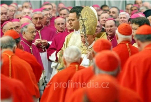
Catholic clergy wearing robes of Purple and Scarlet (Red). Watermark on image is all I know about the source of this image

Now that God has identified who the mother harlot is, I want to make one thing VERY CLEAR. God IS NOT talking about the honest hearted sincere people who are caught up in this system. Most of whom are people who've never even heard His warning about this system. In identifying this harlot woman, this apostate church system, God is warning His people so they can choose which side they will stand on. If you truly love God, you will honor Him and be faithful to Him! God is not speaking against the individual people of the Roman Catholic Church when He identifies the harlot, He is speaking against the religious system which He's identified as the false church of Revelation 17. There's much more to this than meets the eye, but you can be positively sure God's telling you the truth, because He loves you and He doesn't want to see you standing on the wrong side, He doesn't want you standing against Him, but rather He wants you standing with Him.