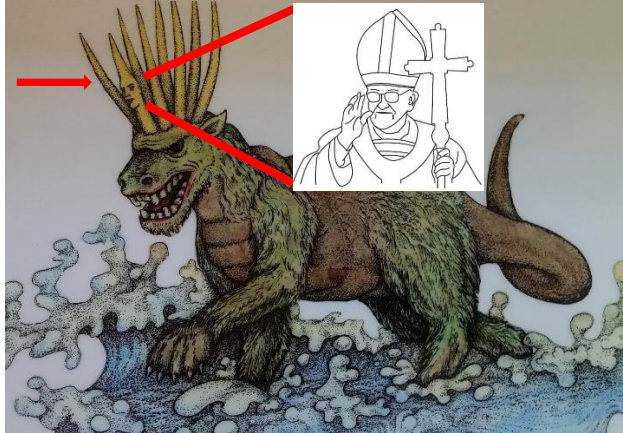
The Little Horn of Dan. 7

Therefore the False doctrine of futurism has Re-Defined the time and place of Biblical events and has directed attention away from the Anti-Christ by saying he hasn't come yet! But the Anti-Christ came centuries ago, and arose from within the church, (as the apostle Paul stated) But today, people are being deceived and are now looking for him to sit in a rebuilt Jewish temple located in Jerusalem at some point in the future.